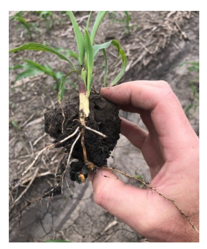
Figure 1. Discolored mesocotyl caused by infection by Pythium.

Fusarium species, like Pythium spp., can cause disease under a wide range of favorable temperatures. But unlike Pythium spp., moisture is not as critical for disease development. Fusarium infections also result in discoloration of the mesocotyl.