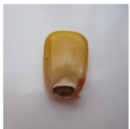
Figure 3. Kernel at black layer, note the darkened tip indicating that full kernel maturity has been reached.