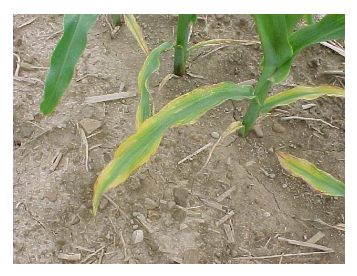
Figure 3. Symptoms of potassium deficiency in corn.