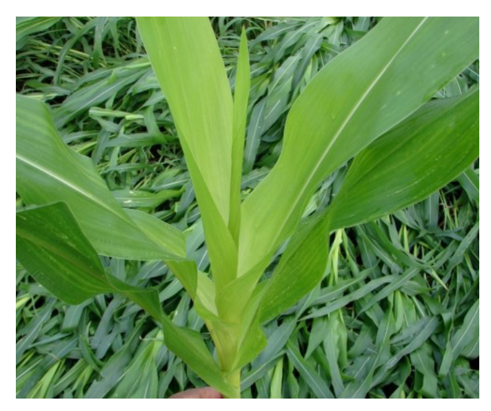
Figure 4. Symptoms of sulfur deficiency in corn.

High-yield corn production environments have benefited from increased yield potential from biotechnology traits and rapid advancement in crop genetics. In order to achieve this increased yield potential, changes in fertility should be considered.