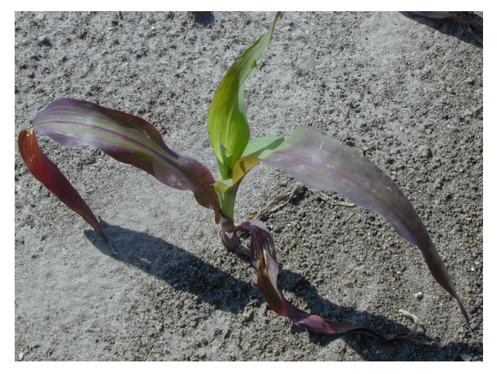
Figure 2. Symptoms of phosphorus deficiency in corn.

Potassium deficiency can be observed on older leaves as chlorotic (yellow), then necrotic (dead) leaf tissue at the leaf tip and migrating toward the stalk (Figure 3). Potassium is essential for the plant to move energy from the leaves for grain fill. If K is limited, silk emergence may be delayed, and ears with unfilled tips may result.<sup>5</sup> Low K levels can result in yellow leaf margins on lower, older leaves. Because K may be recycled back into the soil through crop residue, deficiencies are common when crop residue is removed from the field.