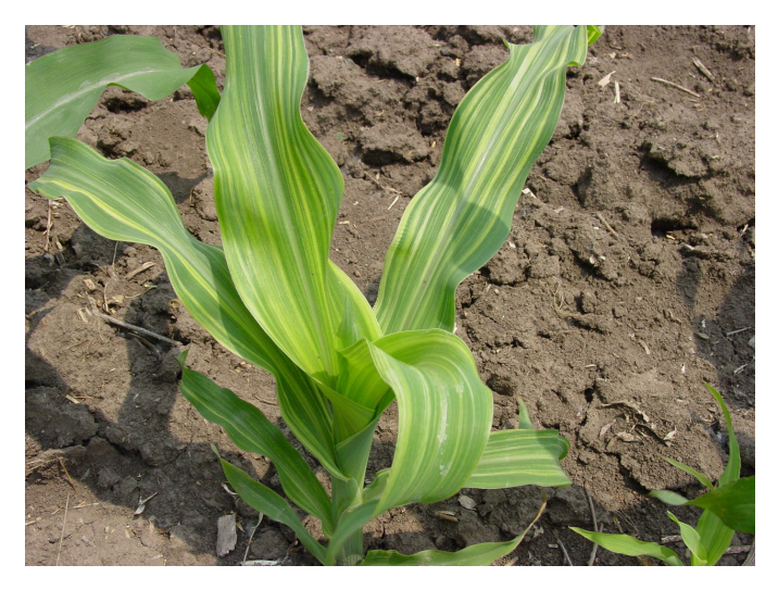
Figure 5. Symptoms of zinc deficiency in corn.

It is important to fertilize according to soil test recommendations and sample soil annually to ensure adequate nutrients are available as soil may be depleted faster in high-yield environments. Soil and tissue analysis, nutrient removal, and realistic yield goals can be used to determine the amount of fertilizer needed. High yield potential can be realized when nutrients are applied according to recommendations and available when nutrient demands are highest.